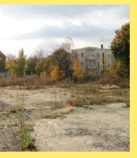
The Brook Street site was a neglected and hazardous site in a densely populated residential neighborhood. The site, shown here in 2002, stood vacant for nearly 20 years before being redeveloped as a park.